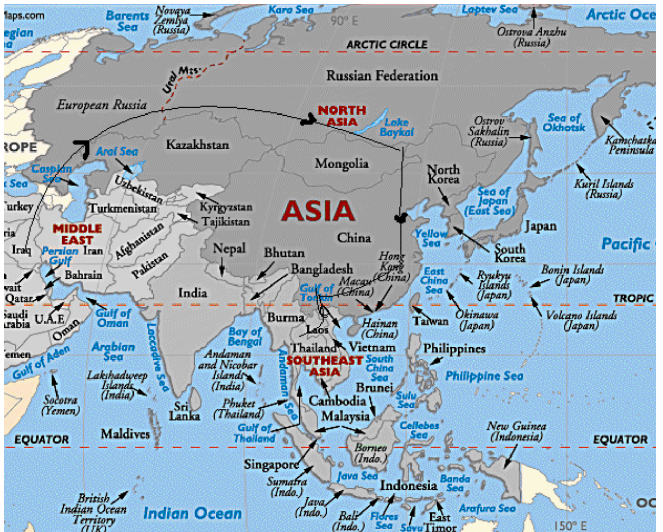
Possible route of Hmong migration – several thousand years B.C. until the nineteenth century A.D.