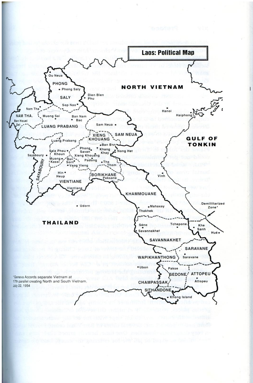
Map of Laos showing Xieng Khouang and the other northern provinces where the Hmong settled.