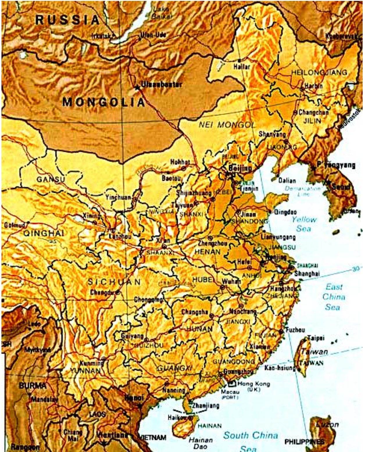
Map of China – English spellings of provinces vary.